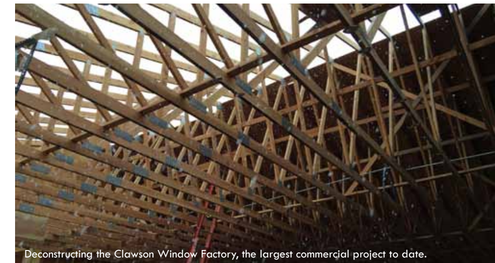
Deconstructing the Clawson Window Factory, the largest commercial project to date.