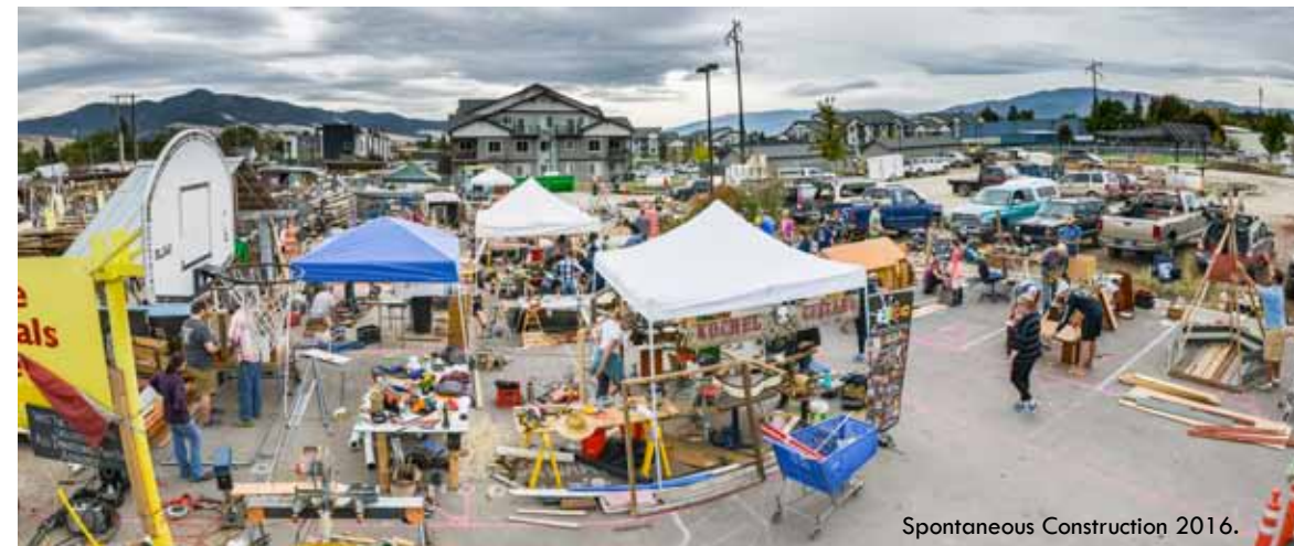
Spontaneous Construction 2016.