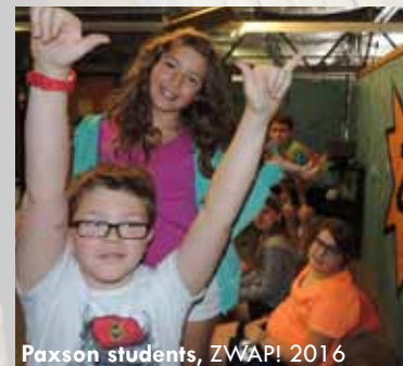
Paxson students, ZWAP! 2016